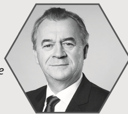
Minister Sven-Erik Bucht, Ministry of Enterprise and Innovation of Sweden

"The development of a bioeconomy requires new competences and cooperations. In the Nordic region we don't have to look far for such fruitful cooperation. We have great potential for the transition into a bioeconomy with plenty of biomass supply. Through Nordic cooperation we can become a stronger voice within the EU and make the most of our potentials."