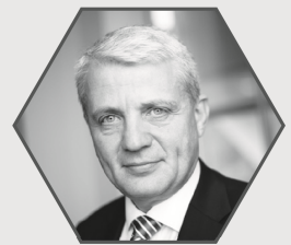
Secretary General Dagfinn Høybråten Nordic Council of Ministers

"One important aspect of a new bio-based economy is the notion of upcycling, using and reusing raw materials in a way that creates more value. This is far more than just recycling and it is a far cry from merely burning waste to generate heat or energy. We need these kinds of activities too, but in a world with scarcer resources we need to plan very carefully for how we use what we have."