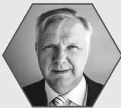
Minister Olli Rehn, Ministry of Economic Affairs and Employment of Finland

"Nordic countries and regions can lead the way in the bioeconomy and inspire countries in the EU and around the globe. We have the natural conditions, the industrial infrastructure and the skills to strengthen our competitiveness and create more jobs, while combating climate change."