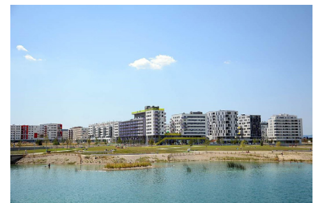
Vienna’s Seestadt Aspern.

The current planning vision for the area prepared by the City of Amsterdam foresees the transformation of this area into to a fully-fledged urban centre, incorporating a balanced mix of business, commerce, residential units, and public amenities. The ambition is for the area to complement the existing city centre, “both physically and emotionally” rather than a “cloned international business district”. At the same time, the area will retain certain characteristics that will set it apart from other parts of the city. A main attraction will be its spacious dwellings and offices, which the densely-built inner city cannot offer. Parking facilities will also be more generous (although this policy is in opposition to TOD tenets).