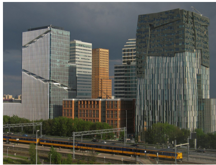
Amsterdam’s Zuidas district.

The new city district will be connected to the public transport network of Vienna and the wider metropolitan region through metro, light rail and heavy rail as well as the tram and bus network. The new metro line was opened in October 2013, prior to the development of residential areas. A management group has been established with the aim of maximising the attractiveness of streets and public spaces, in which a broad choice of shops, restaurants and other services are provided. The highest densities in Aspern Seestadt are to be found around the two metro stations. Aspern Seestadt can be considered both as a single node TOD and a corridor TOD (Box 2).