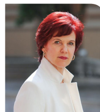
SOLVITA ĀBOLTIŅA Chairperson National Security Committee Latvia

With regard to cyber security, we must keep reminding ourselves that the best weapon against cyber threats is intelligence and critical minds that do not yield to provocation, deception and confusion. The only sustainable solution for the future is promoting critical thinking, improving analytical skills and raising media literacy. This is just as important as the continued efforts of the state to ensure its national security. We cannot depend on our allies and Article 5 alone; we need to be able to defend ourselves in cyberspace just the same as at our national borders. ■