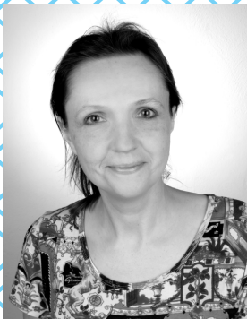
GISELA GRIEGER China's One Belt One Road (OBOR) initiative: a win- win situation for the Baltic Sea Region (BSR)?