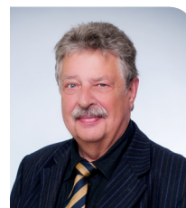
PETER W. SCHULZE

Further, it seems to be clear that no conflict in CIS is solvable without Moscow's participation. What's even more pressing for the EU, the Minsk II agreement would collapse the moment Moscow would withdraw its support. ■