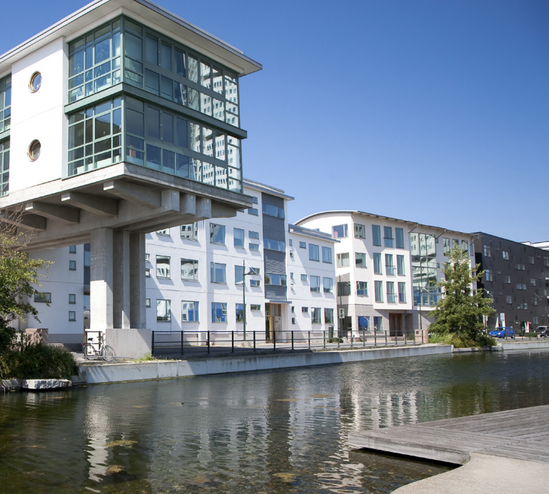
Western Harbour. Malmö.

cern regarding the impacts of water-related issues—such as increased precipitation, sea level rise and urban flooding, all of which are projected in this region by the IPCC. Nordic cities have translated this concern into an opportunity to renew and reinforce their commitment to high-quality green and blue spaces.